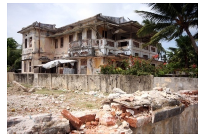
Figure 4: Ruined houses in war affected Jaffna town Sri Lanka