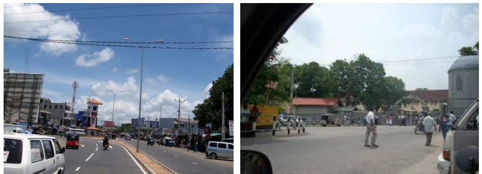
Figure 9: Wider roads with more spaces for people- City of Dambulla (left) and Kurunegala( right)

Visual unpleasantness, obstructions to infrastructure facilities, empty upper floors, unfinished buildings, and re-use of old materials are other symptoms of the declining urban fabric in the current city.