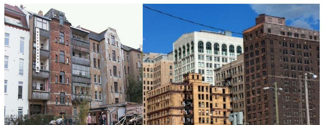
Figure 2: Youngstown- Deteriorated Building textures and materials – Source-http://shrinkingcities.wordpress.com/

The term urban transformation is chosen because the urban fabric is not a fixed unit remaining the same. On the contrary, the urban is ever changeable and continues to transform into new forms. Graham Shane (2005) considers "urban as being a mutating organism." He defines the city as being a mutated organism; an organ that is alive and transforming.