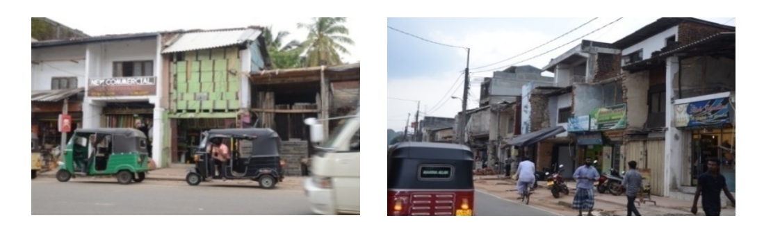
Figure 6: Chaotic built forms abandoned buildings and deteriorated urban fabric – City of Matale

The present city structure is dominated by less maintained abandoned and vacant building plots, thus coursing visual unpleasantness and chaotic urban fabric.