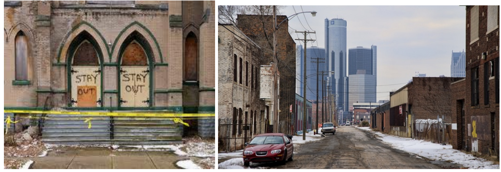
Figure 3: Abandoned of public spaces in shrinking cities http://shrinkingcities.wordpress.com/

Buildings are the most noticeable elements in any city and the collection of built features that give each city its unique character. This unique character would be destroyed with the declining, phase, especially in shrinking cities. The awful environment results in the changes in population densities, economic efficiency and social-cultural relationships. The above results the negative transformation of built forms as immediate effects. The forms that flourished in the past and spaces in buildings become transformed to vacant, decaying, less maintained buildings with the negative changes in the urban structure of the city.