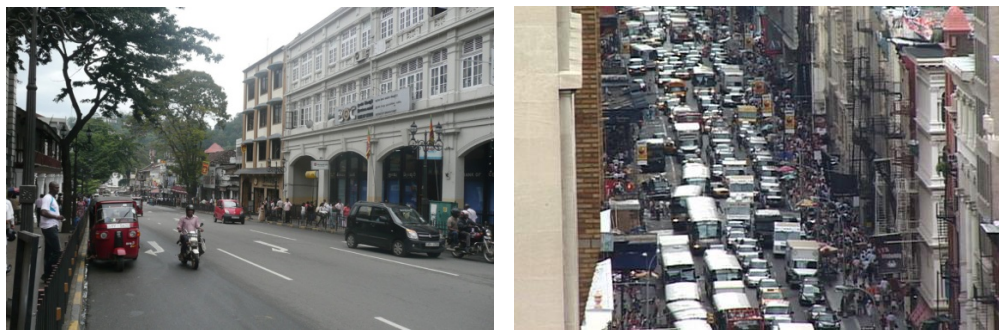
Figure 7: Developed City- Organized built forms, fully operated buildings and diverse urban fabric — City of Kandy

Figure 6: Chaotic built forms abandoned buildings and deteriorated urban fabric – City of Matale