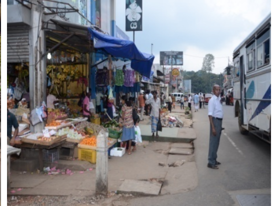
Figure 10: use of main roads as walkways