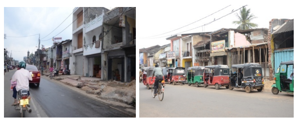
Figure 8: Poor architectural and environmental qualities- City of Matale

17% of the abandoned and vacant buildings are identified on the two main streets in the city. The remaining built forms are chaotic, have less interrelationships, and have been built in an environmentally questionable manner with poor architectural and environmental qualities.