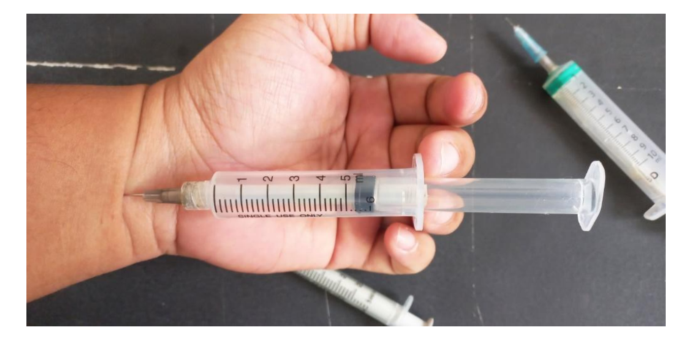
Fig.5 - Usage of retractable prop needles