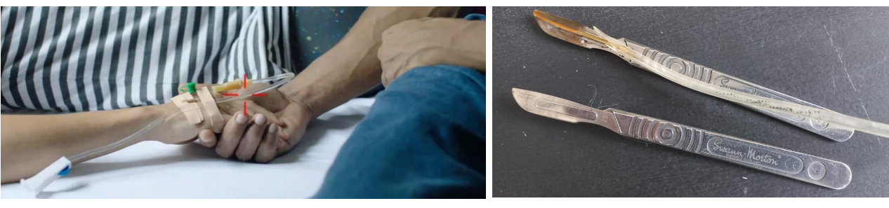
Fig.1 - Retractable prop Cannula used in actress hand

Keywords: Props, medical drama, safety, dummy props