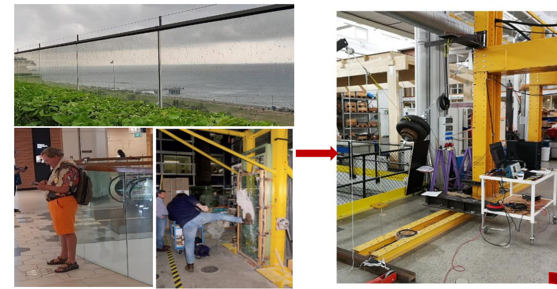
Human impact loads on Glass Balustrades