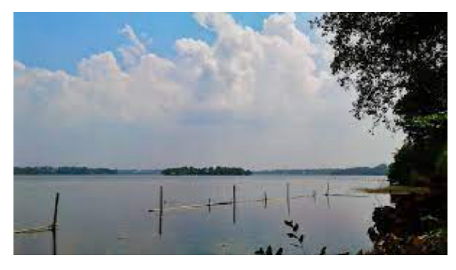
Figure 2: Bolgoda Lake

Bolgoda wetland system [Figure 2] has been home to endemic and endangered fauna and flora and a