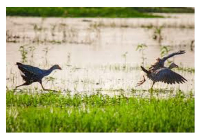
Figure 3: Avifauna

resting place for migratory birds making it rich in biodiversity [Figure 3]. Studies revealed vertebrate fauna and higher species diversity of dragonflies in Bolgoda South Lake and significant faunal profiles from both lakes. Furthermore, endemic plant species from the south lake exceed the north lake [2]. The north lake has a limited floral diversity and a considerable growth of invasive plants including the Water Hyacinth (Eichhornia Crassipes) which is considered as the globe's worst invasive plant.