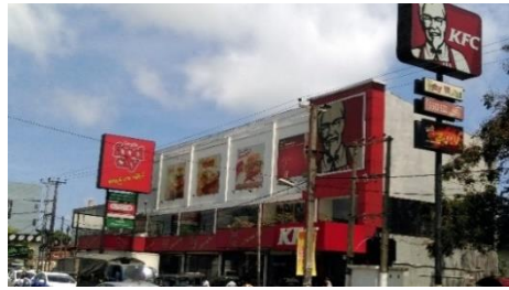
Figure 20, Building Form of the KFC Building

The observed street characteristics are form, shape, color, building height, surrounding environment, visibility, tree canopy, landscape features and functions.