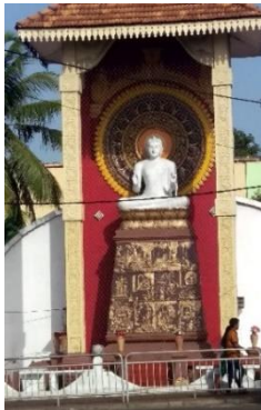
Figure 21, Buddha Statue in the Belekade Junction

The Lanka Sathosa building which is a commercial building that consists of a large parking area in front of it which attracts the passerby though the building doesn’t have a strong attractive characteristic the open space amidst the other walls and building facades has implied a specific “change” along the road.