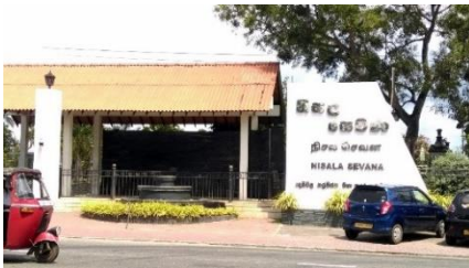
Figure 14, Entrance of the Mount Lavinia Cemetery

Arpico Super Centre on the other hand depicts a more memorable space than the cemetery discussed above. The main reason for that was observed as the color of the building, and the volume and scale bring a specific look. Thus, it has become a memorable landmark in the area.