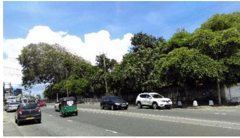
Figure 5, Boundary wall of Mount Lavinia Court Complex

Comparatively discussing it can be identified that though the boundary wall of St. Tomas College works as an edge, its memorable percentage has reduced due to its untidiness and unattractiveness.