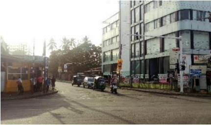
Figure 10, Templers Road Junction