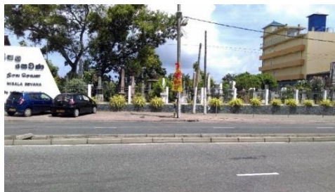
Figure 45, Mount Lavinia Cemetery Boundary

Zone A - Mount- Lavinia Cemetery Boundary is linear boundary, use of greenery which is visually appealing to the passersby, creates a unique feeling which is less harsh and more aesthetically appealing to any pedestrian or motorist, entirely different view to the user when compared to cemeteries in the early days which had only a simple barbed wire or a short wall as a boundary that easily created the “eerie” feeling within a passerby making the space unwelcoming and more of negative atmosphere thus not allowing the passersby to walk peacefully and breaking down the continuity of the building façade.