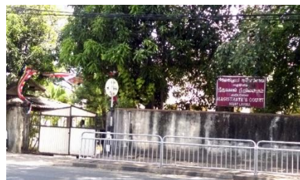
Figure 17, Entrance of the Mount Lavinia Court Complex

The KFC building is also considered a memorable landmark due to the building structure, building faced variations and colors used. The outdoor gathering space near the KFC favors the characteristics that highlights this building.