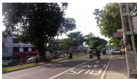
Figure 7, Tree Line middle of the Street

Zone E - The tree line in the center line of the main street is identified as a significant edge. This consists trees of massive size which are enhanced by the carpets of grass underneath it. The road is divided into two parallel lines and thus demonstrates a boundary characteristic.