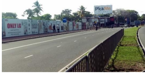
Figure 8, Open Space in Front the Airport

The observed street characteristics are arrangement of elements, linear patterns, landscape features, and materials.