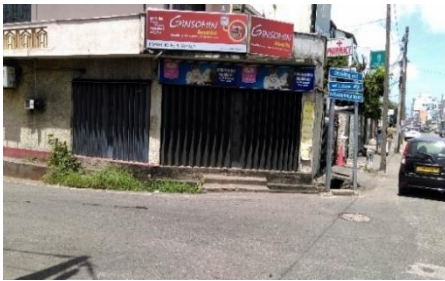
Figure 43, Entrance of the Wtarappala Road

Zone B - When considering the Wattarappala road, the width of it seems to be wider than other streets thus creating a more comfortable space for the users of the road. As it allows easy accessibility and more suitable space when considering the anthropometric characteristics as well. Further it was noted that it doesn't demonstrate a narrowness like Pinthaliya road, which was noted as a more insecure place due to its narrowness.