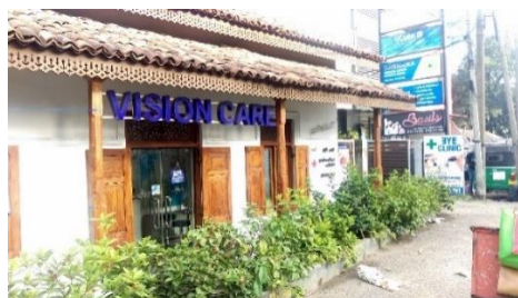
Figure 6, Front View of the Vision Care

Zone C - Though the edges in zone C cannot be identified clearly the narrow linear edge opposite the Vision Care was suggested as one that demonstrates a boundary characteristic enhanced with its simple landscape with short green bushes creating a rather “cool” vibe.