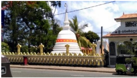
Figure 19, Dharmendrarama Temple