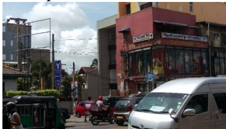
Figure 9, Area of the Kawdana Road Junction

Zone A - The most functional surrounding junction is observed along the Kawdana road. This is due to the fact that this junction was found to be one of the most memorable junctions compared to others. Most of the people in this area use this junction as a “village junction” thus it has developed the area near Kawdana Road as a commercial area or if stated in simple terms it has attained an identity of a typical junction in a village known as a “Handiya”. This junction stands out as a very busy area as many people uses the Kawdana Road as a shortcut. All other junctions are less noticeable because they are much more narrow roads when compared to the Kawdana Road.