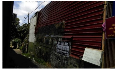
Figure 44, Entrtance of the Pinthaliya Road (Source: by Auther)

The observed street characteristics are width of the road and visibility.