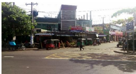
Figure 12, Kadawala Mawatha Junction (Belekkade Handiya)

The airport junction which has connected to the new airport Rd has become memorable due to the surrounding environment. Therefore, an open space has created around the area of airport which is also a reason to making the area memorable. This junction is also popular due to the situation of the Kothalalwala Defense University and Telecom.