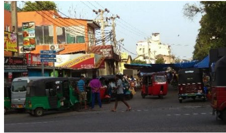
Figure 11, Station Road Junction

The observed street characteristics are surrounding environment, activities and functions.