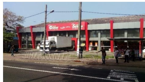
Figure 22, Building Form of Lanka Sathosa

The observed street characteristics are form, shape, color, building height, landscape features, surrounding environment, visibility and functions.