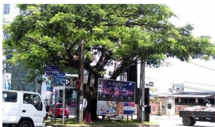
Figure 16, The Mara Tree in the Odel Junction

Mount Lavinia court complex has become a memorable element due to the tree line in front of it as discussed previously. This has emphasized the silent nature around the court complex.