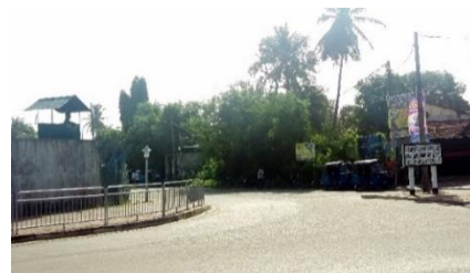
Figure 13, New Airport Junction

The observed street characteristics are surrounding environment, activities and functions.