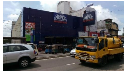
Figure 15, Building Form of the Arpico Super Center

The observed street characteristics are landscape features, surrounding environment, shape, volume, color, building height, visibility.