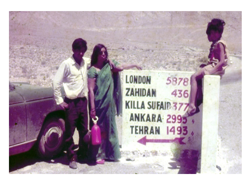
On the way from London to Colombo 🔺

I have written several books in both Sinhala and English languages. My first book is titled "The Lay of the Sinhale" and the last book I published is "Ayesha at the Himalayan Foothills". I also wrote an e-book "Hanuman Tower" about a lady engineer. Now I am writing a book on Thermodynamics in Sinhala, and I am currently working on the last chapter.